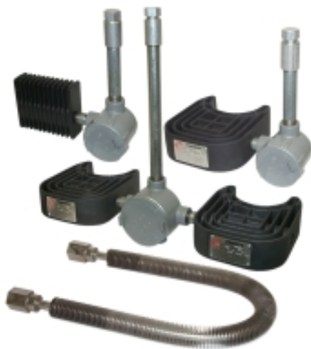
Steam and Electric Heaters