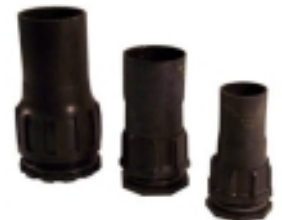
Heat Shrink Entry Seals